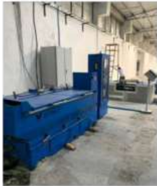
1. Intermediate Wire Drawing 2. Make : Imported