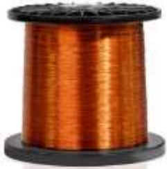
Enameled copper round wire