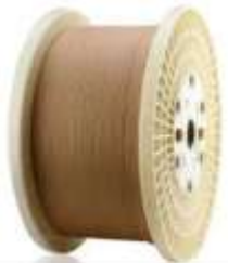
Paper covered Aluminum Flat wire and round wire