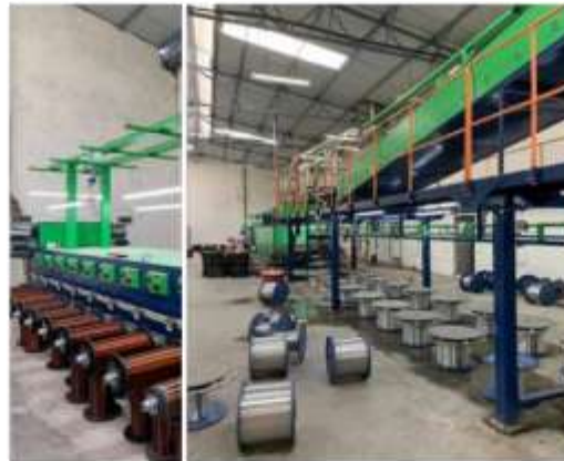
1. Horizontal Wire enamelling Machine 2. Make : Imported 3. Enamel Application method : spray dye method (9 pass) 4. Take up spools : PT 25, PT 60 , PT 90.