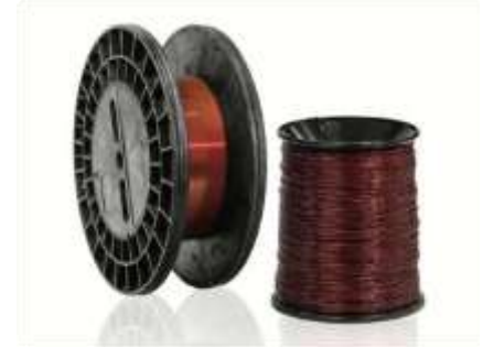
Enameled Aluminum round wire