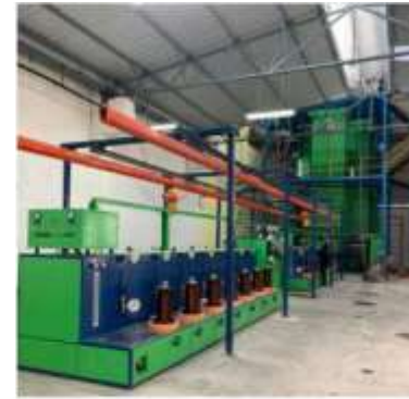
1. Vertical wire enamelling Machine 2. Make : Imported 3. Total Lines : 28 4. Wire range : 1.2 ~ 3.0 mm 5. Enamelling Application Method : Dye System ( 8 - 12 pass)