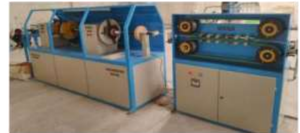
1. Double paper covered Strip machine 2. Make : Indian 3. Input paper : Insulating Kraft paper Insulating crepe paper