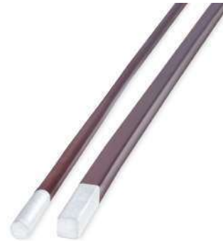
Enameled Aluminum Flat wire