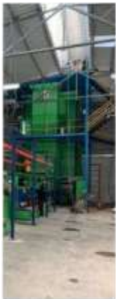
1. Vertical Strip enamelling Machine 2. Make : Imported 3. Total Lines : 2 4. Range : 10 ~ 80 mm Squared 5. Enamelling Application Method : Felt System ( 13 passes)