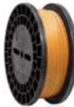
Paper covered copper Flat wire and round wire