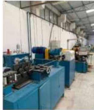
1. Konform machine 2. Make : Imported