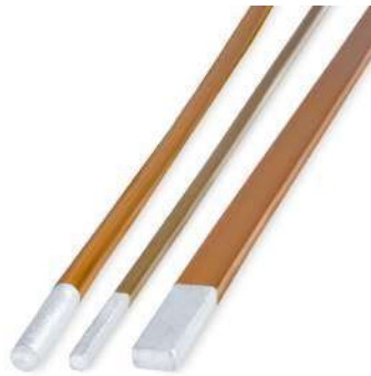
Enameled copper Flat wire