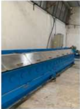
1. RBD machine 2. Make : Indian